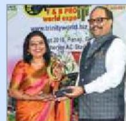
President of Chamber of Commerce welcomed