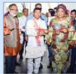
India's Minister R Teli & Congo Ambassador