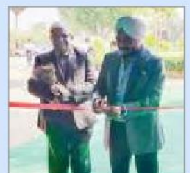
Hotels & Restaurants Association President