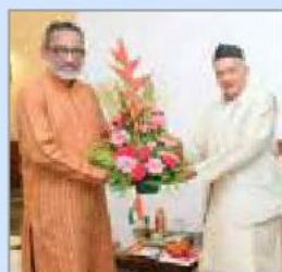
Governor of Maharashtra & Impex Chamber Mg. Dir.