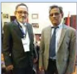
President of Mauritius & CMD of Impex Chamber