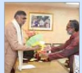
India's Tourism Minister Prahlad Singh Patel