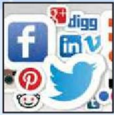
Social Media & Telecom