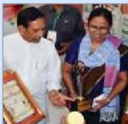
Sri Lankan Minister & Kerala Health Minister