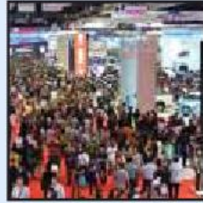
In Venue Displays