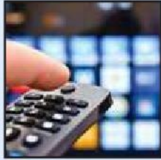
TV & Cable Channels