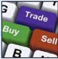
Associations & Chambers